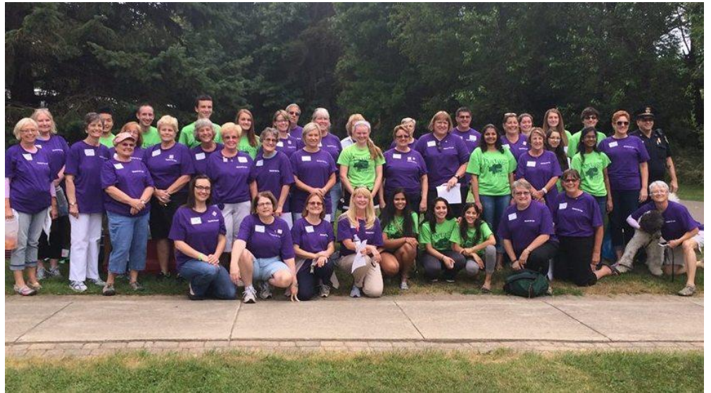
BOCK and the YOUTH ADVISORY COUNCIL OF PORTAGE at the Respect For Law Event at Celery Flats